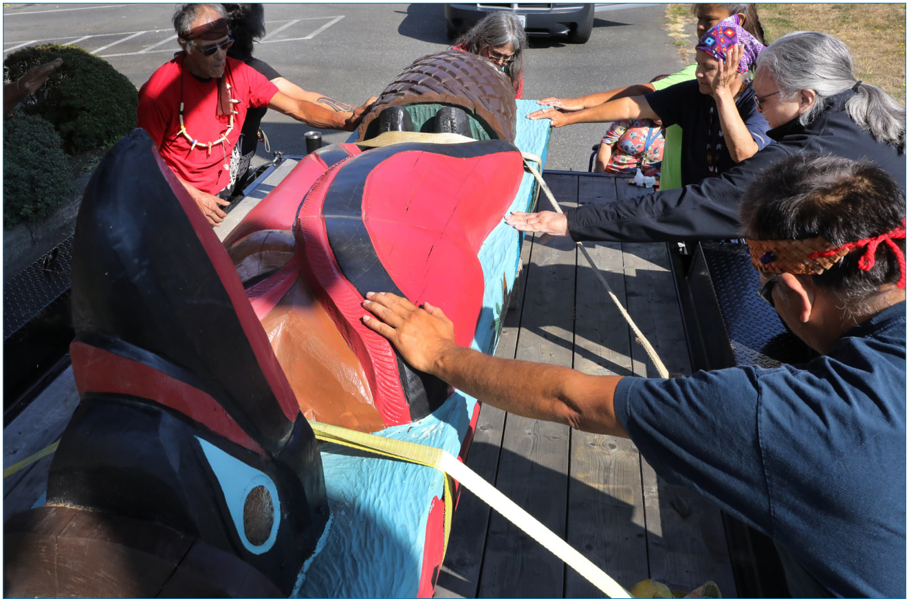
THE FIRST BLESSING • Lummi tribal elders cast the first blessing upon the Chief Tsilixw Totem Pole in September 2, 2022 at Little Bear Creek, Lummi Nation.