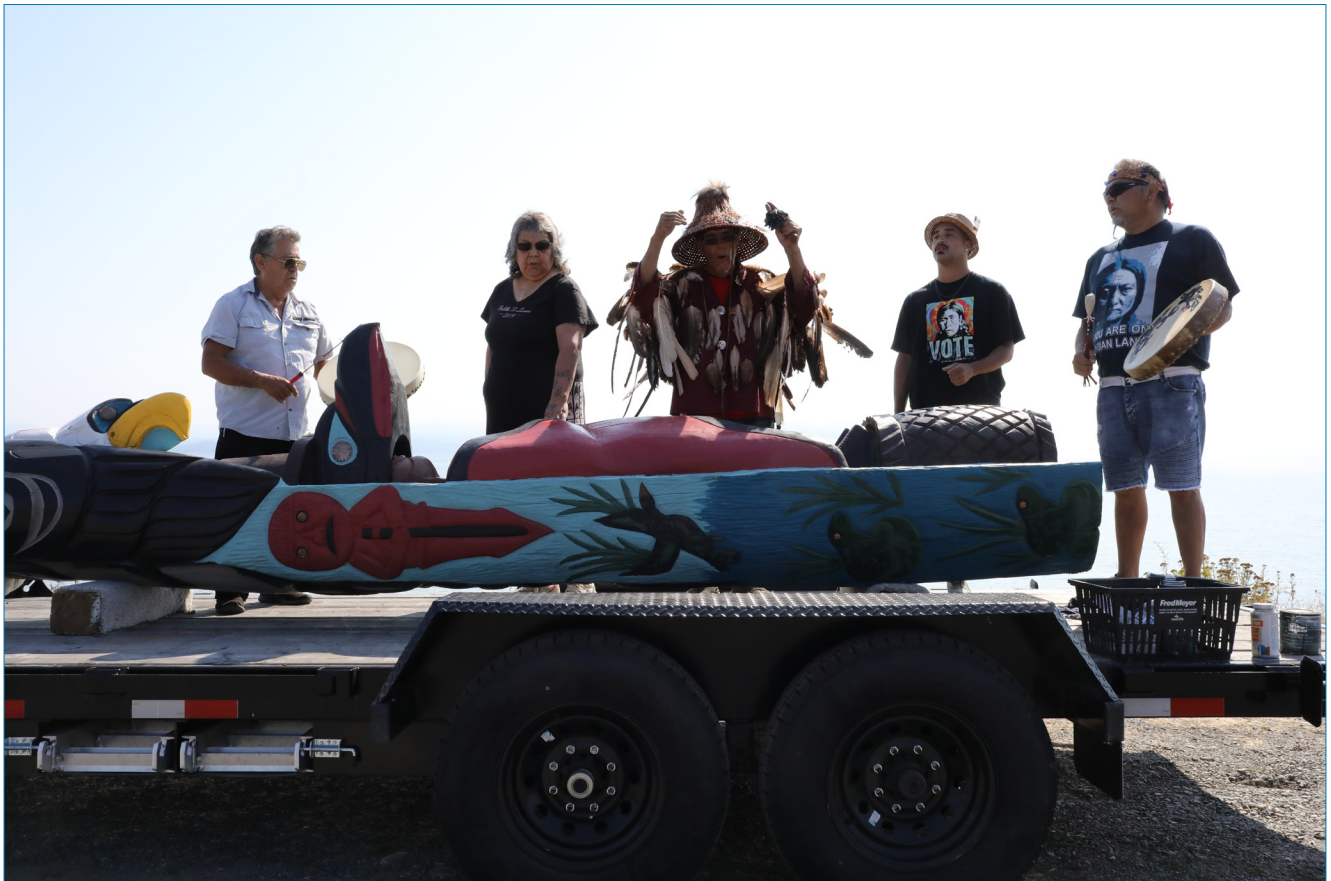
House of Tears Carvers and the Golden Eagle Clan unite in efforts to protect Mother Earth with the Alliance of Earth, Sky and Water Protectors on the next to journey to Pittsburgh PA